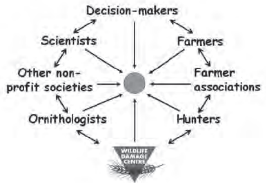
Figure 3. An example of how a management group may be composed. In Sweden, these groups have been founded on the initiative of managers and decision makers at the county administration boards.

To develop a management plan, it is necessary to collect as much basic information as possible about the ecology and behaviour of the birds and the spatial and temporal variations of the damage they cause. This information is important for guiding where, when and how preventive measures should be implemented in the area of interest. Therefore, the next step should be to collect such